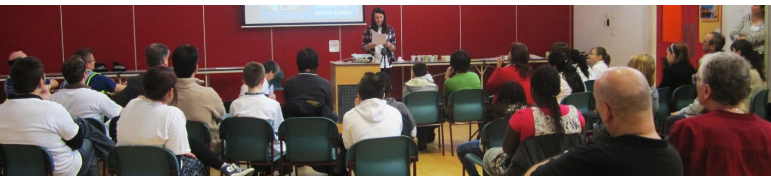
Presentation by one of the young organisers

'Good to know and talk to the local police on a daily basis.'