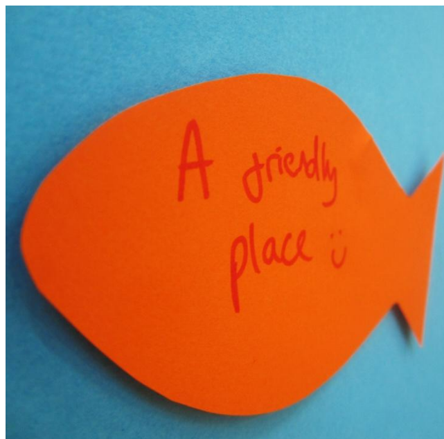
'Fountain of the Future' (the fish represented what they like about living in the community)

Numerous comments were made throughout the workshop about the design of the community and the ongoing construction work. In terms of the design, the participants were positive. They said: there are a range of house of different sizes and styles for different families; the community is well designed; the houses are efficient; the site is in a good location, close to the countryside; and within the community there are large green spaces. Very small gardens were mentioned as the only real downside of the community design. However, numerous comments were made regarding living with the ongoing development and construction of the site. Both children and adults made reference to this. Their comments included: muddy roads; the wish for cleaner roads and less construction.