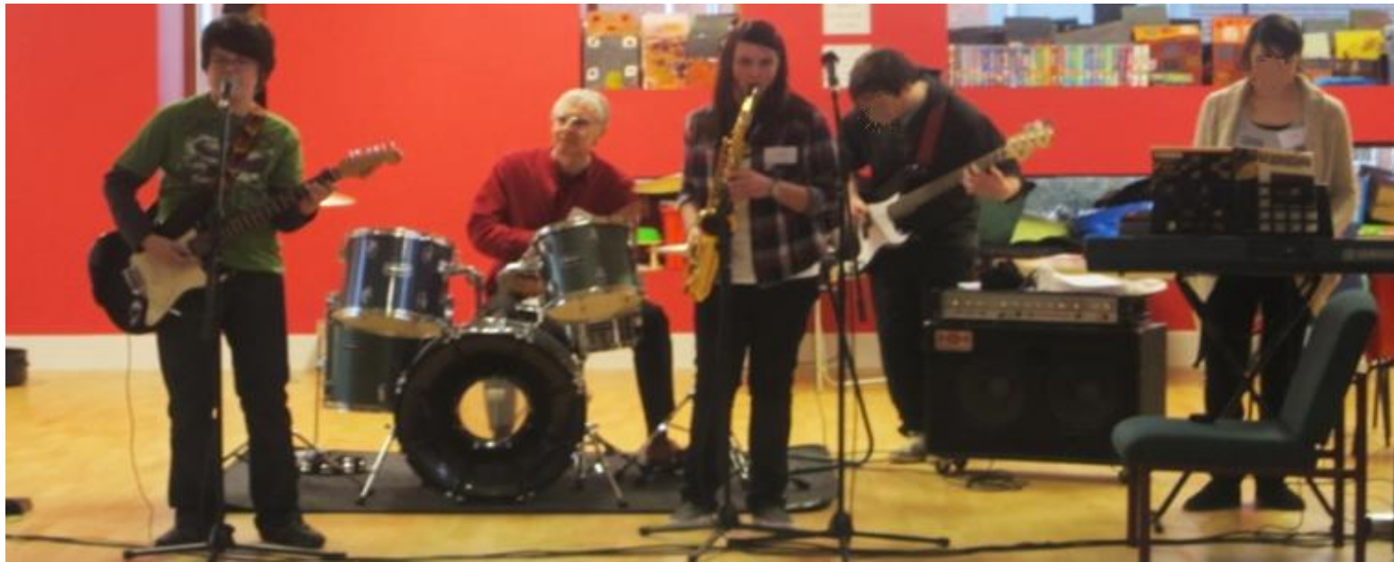
The local band played at the end of the event to all participants and parents.