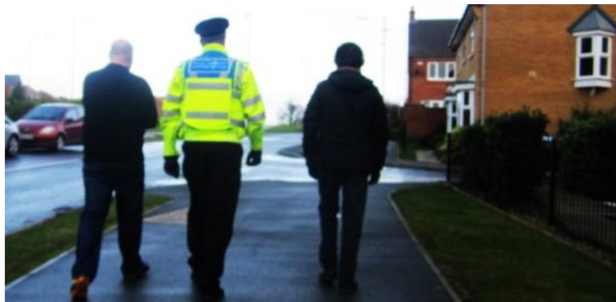
Community guided walks with workshop participants

There is currently only one park designed for children and young people. Children and young people identify this as a meeting place which is fun and has good equipment. There were several references to problems with litter and broken glass on the ground; and the issue of maintenance. The local youth band often collected litter. The young people taking part in this task pointed out the lack of proper bins and suggested suitable places to put these. There were numerous expressions of the need for a space specifically for the older young people. Their wishes included: a park with larger equipment; a skate and a bike park.