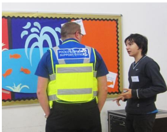
Workshop participants discussing by the 'Fountain of the Future'

'Will make more time to talk / listen to them [young people] in the future.'