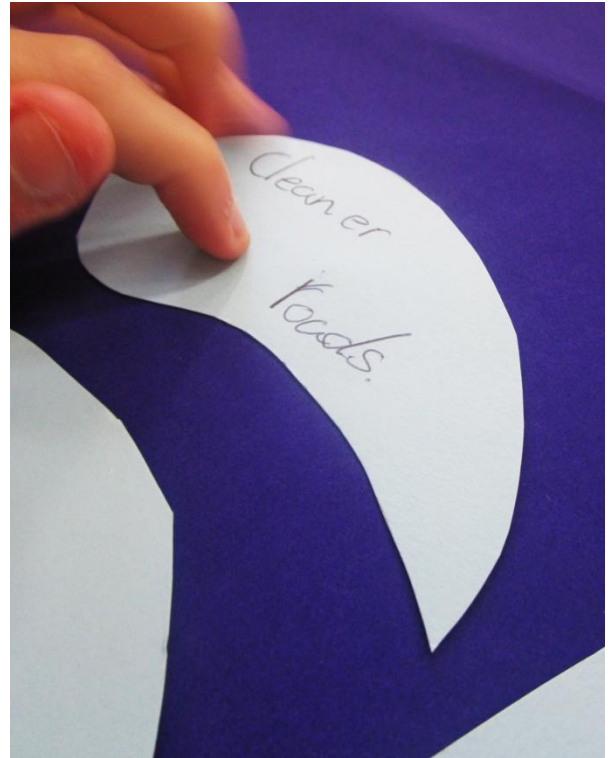
A selection of photographs taken at the workshop